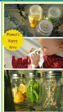
Sniffing Scent Jars