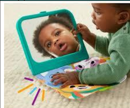
Cute crinkle mat engages baby's senses